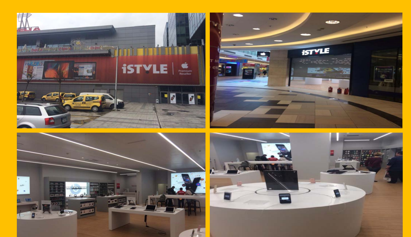
IStyle store THE MALL Sofia