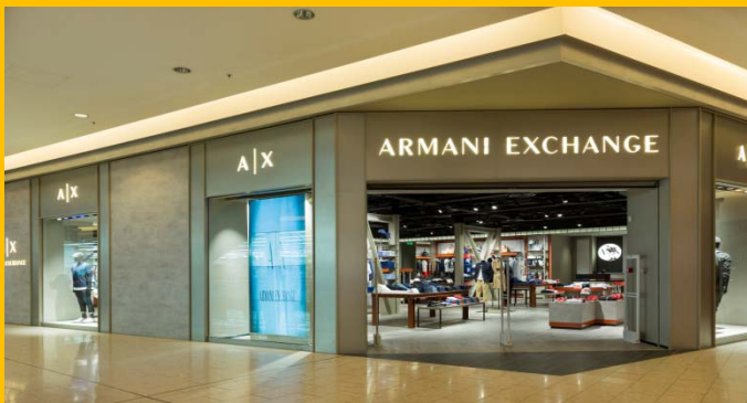
Armani Exchange Nicosia Cyprus for Ermes Department Stores PLC