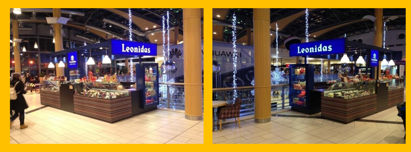
LEONIDAS Pralines Island THE MALL Sofia For Noire de Noire Ltd